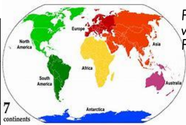
The Earth is split into 7 large areas of land called Continents.

France is famous for cheese, wine, perfume, and the Tour de France (a 2,000-mile bike race).