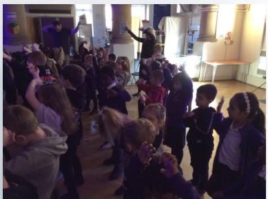
The children really enjoyed their first experience of Rock Kidz and were amazing Rock Stars!