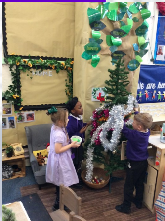
The children have had lots of fun getting ready for Christmas.