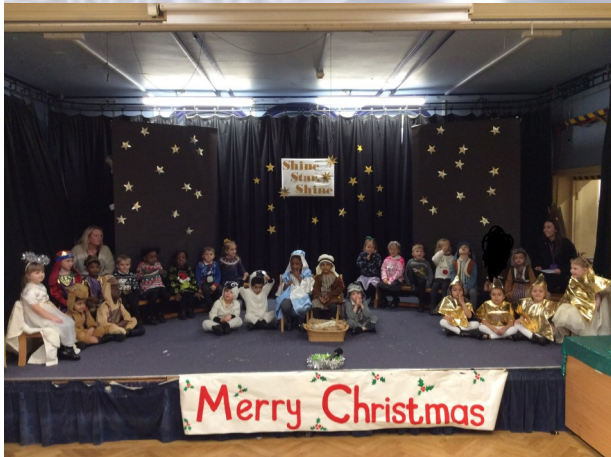
Showing our Christian Value of Respect.